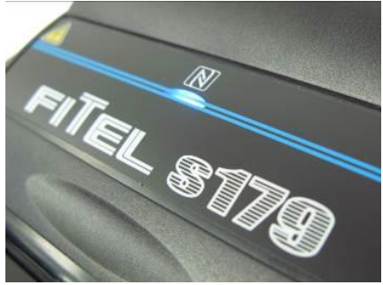
NFC: Lock and Unlock