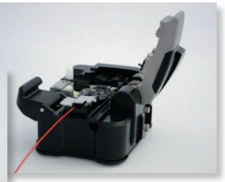
Wide lid opening angle