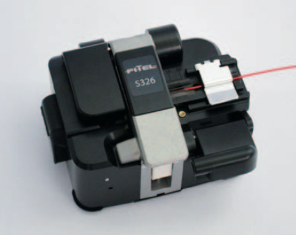
Operation on desktop

With its ergonomic and light weight design, the S326 cleaver offers the operator the versatility to cleave on a work bench or in the palm of their hand. The reduced lid size and wide opening angle facilitates fiber loading and improves stability resulting in better single and ribbon fiber cleaves. Just pressing the lever completes the fiber cleave and automatically collects the waste. With 24 positions, the long life-time blade achieves 48,000 fiber cleaves. The S326 cleaver can offer optical fiber cleaving for a full range of OSP and OEM applications. The S326A configuration comes with both the regular and large size fiber waste bin or users can choose the smaller S326B option without a bin.