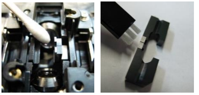
Detachable V-groove and Easy Cleaning