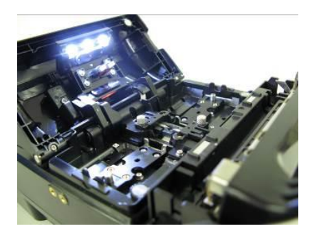
Illumination lamp: 3+1 LED