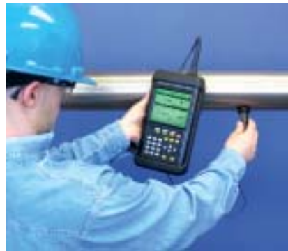
Optional pipe wall thickness gauge

To be of real value, a portable flowmeter must be as economical to own and operate as it is capable in the field. The TransPort flowmeter is built to stay in service for many years. Completely solid state, the device rarely wears out or needs servicing, resulting in little downtime and low maintenance costs.