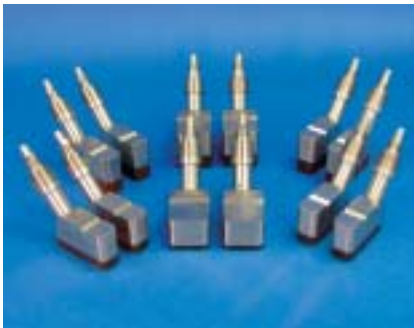
GE Panametrics technologically advanced clamp-on gas ultrasonic transducers

One of the biggest challenges in developing clamp-on ultrasonic transducers for gas applications is the difficulty in transmitting a coded ultrasonic signal through a metal pipe wall, through the gas, and then back through the pipe wall to the second transducer that is waiting to receive the signal. In gas systems, only 4.9 \times 10^{-7} percent of the transmitted sound energy is actually received by traditional ultrasonic transducers. This simply isn't enough to produce reliable measurements.