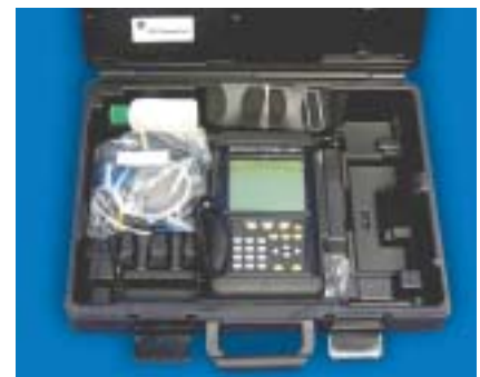
The PT878GC portable system in carrying case

The new meter was tested extensively on metal pipes with diameters as small as 4 inches and pipes as large as 24 inches. Suitable applications for this meter include flow measurements of air, hydrogen, natural gas and many others gases. Using patented Correlation Transit-Time™ detection techniques, demonstrated accuracy is excellent at better than \pm 2 percent of reading with \pm 0.5 percent repeatability.